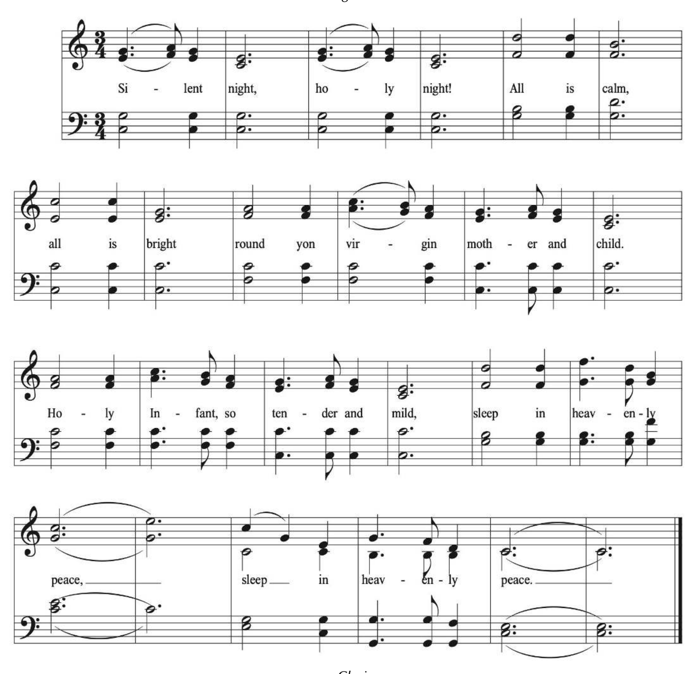
Choir Sung in German

Please remain seated. All sing at the invitation of the director